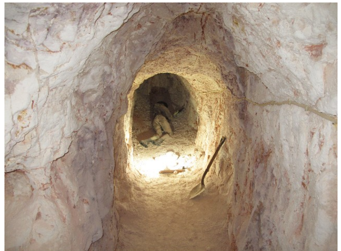
Opal Mine Coober Pedy