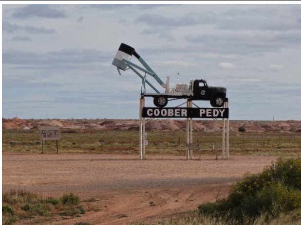
Coober Pedy Town Sign