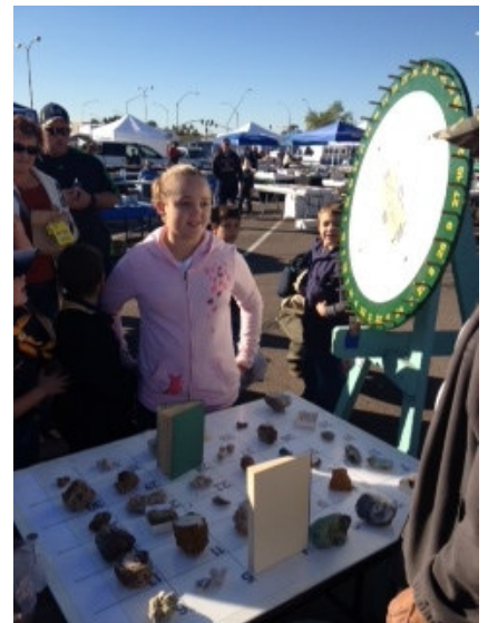
One of Our Hopeful (and probably repeat) Customers